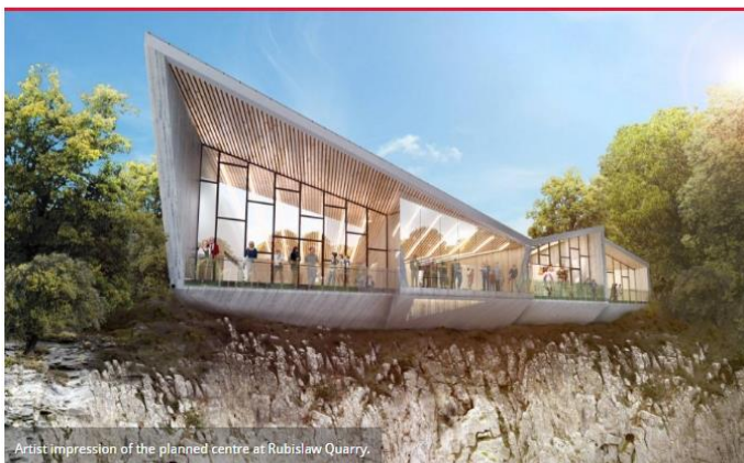
Artist impression of the planned centre at Rubislaw Quarry.