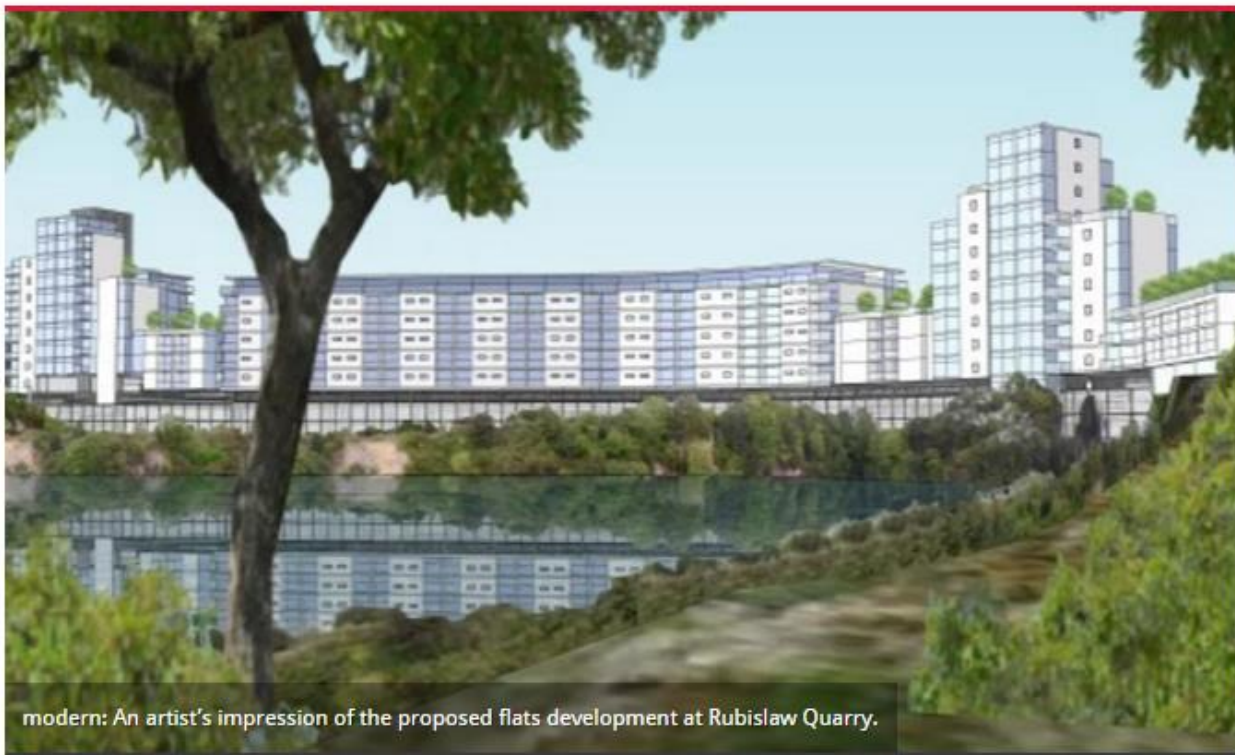
Photograph above appeared in the Evening Express on 15 th October 2016

Members of the Design Team and client body were in attendance to answer any queries.