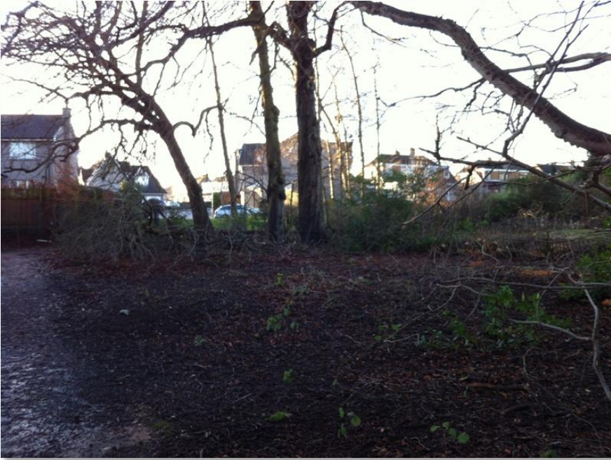
View from core path looking towards amenity grassed area at Kemnay Place