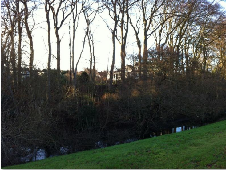
View of the site from Woodburn Gardens