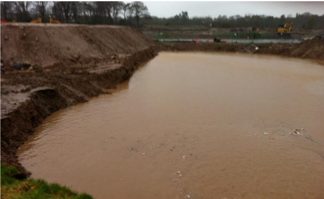
Retention Pond now very full