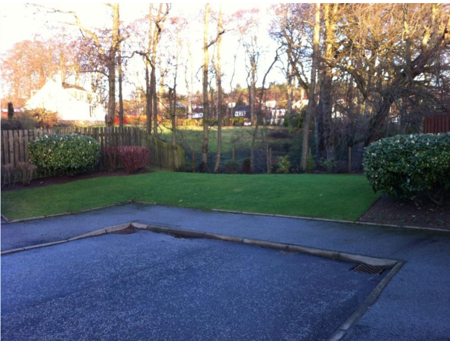
View from Kemnay Place showing amenity ground, looking towards proposed driveway to new house