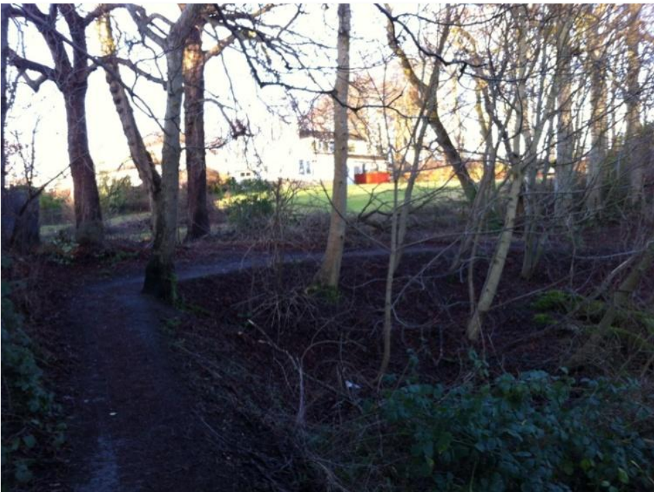
Core path running alongside garden of 22 Kinaldie Crescent