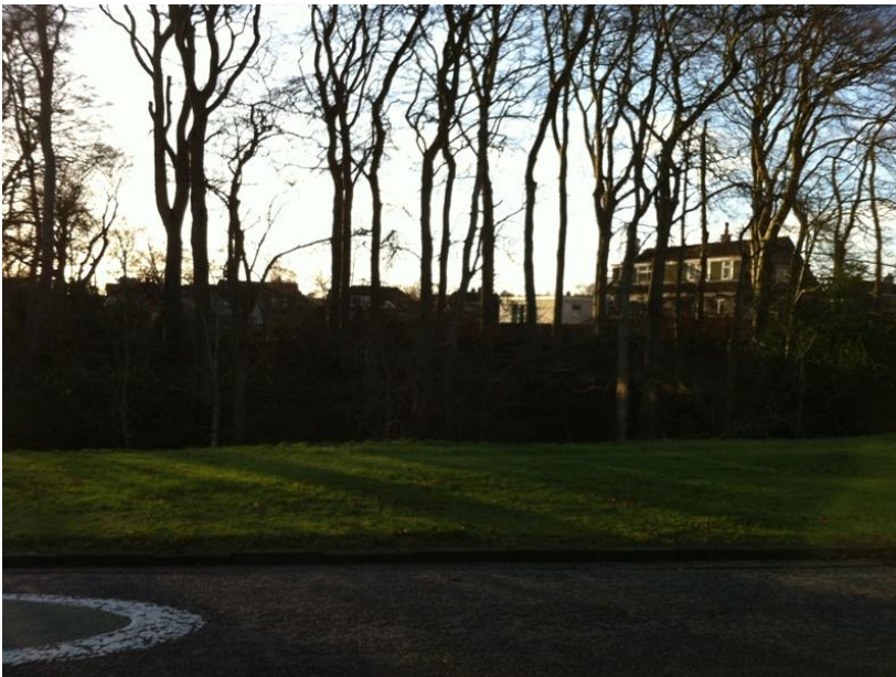
View of the site from Woodburn Gardens

A very well written and comprehensive letter of objection is being drafted by local residents.