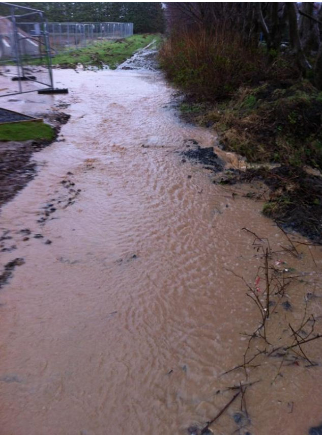
Flooding at rear of sales pod