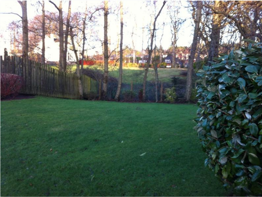
View from Kemnay Place showing amenity ground, looking towards proposed driveway to new house which will lead to a high solid gate and wall entrance to the proposed house.