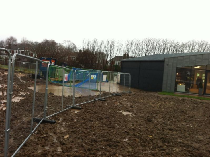
Flooding at rear of sales pod