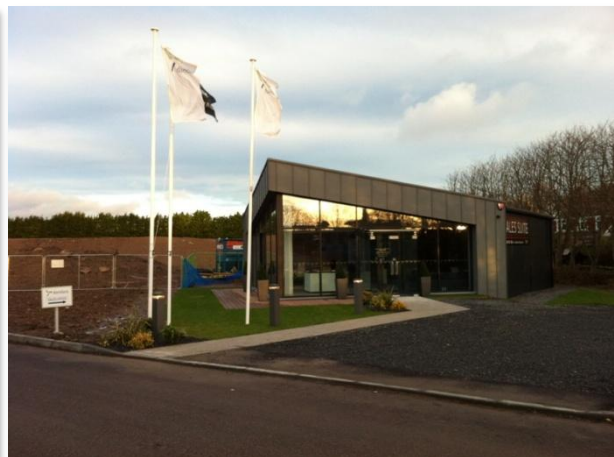
Sales Pod now open