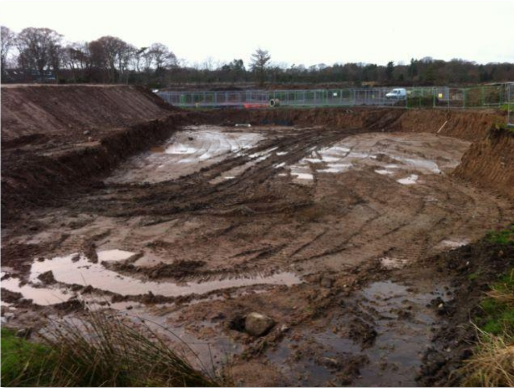
Empty Retention Pond

After heavy rain for approx 5 hours on Sunday 26 th January a large volume of surface water can be seen running off the Dandara site and into the Retention Pond