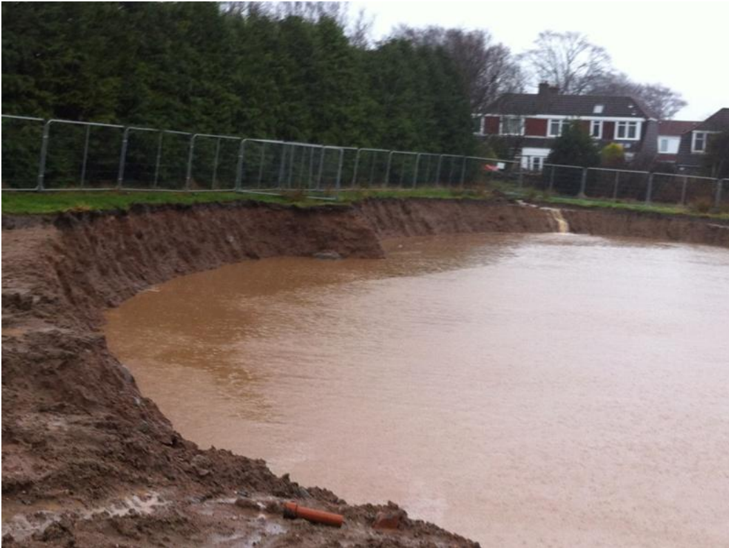
Water being drained into the retention pond, near rear gardens of Burnieboozle Crescent